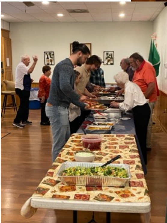
Scenes from our Thanksgiving dinner.